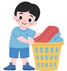
fix dirty laundry