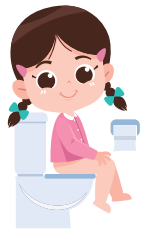
go to toilet