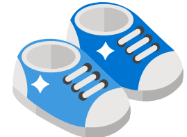
put on shoes